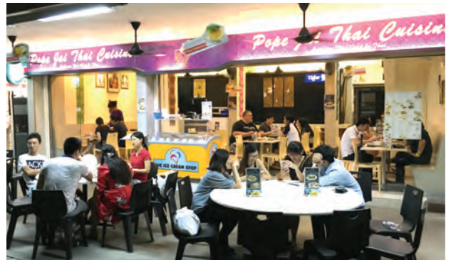
2013-2016: Pope Jai Thai Cuisine at Serangoon Ave 3