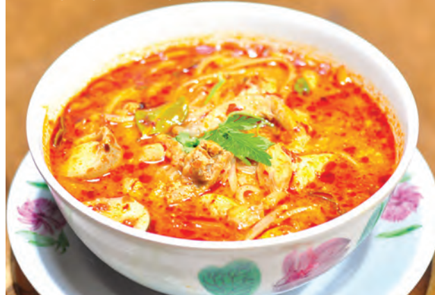
RED TOM YUM KWAY TEOW SOUP