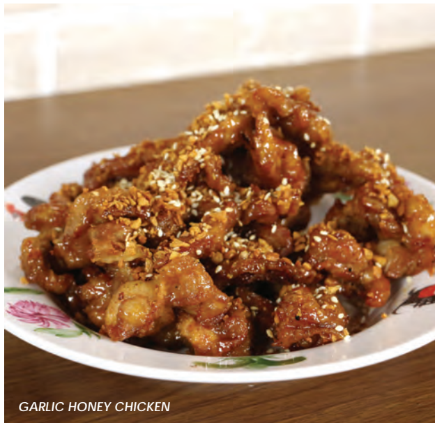
GARLIC HONEY CHICKEN