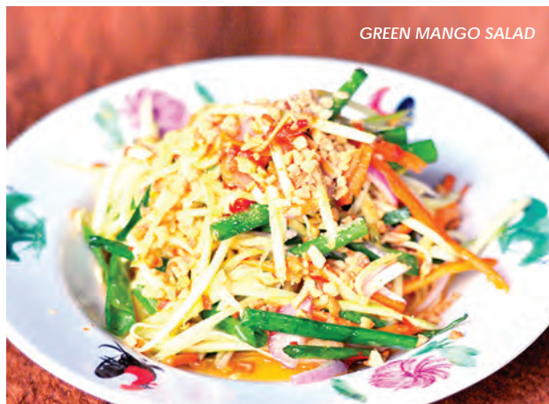
GREEN MANGO SALAD