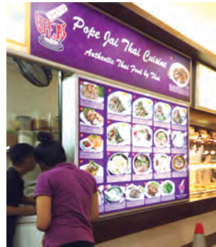
2012-2014: Pope Jai Thai Cuisine at Pearl Centre

Adopting design thinking, we utilise a simplified redesign model to constantly innovate solutions that enhance productivity for all employees, while at the same time assisting employees who face challenges in their daily routines. One of our innovations is a unique light bell system that lights up to notify employees that there is a new order. Other support materials we have introduced include customised chopping boards with templates to ensure consistency in cutting.