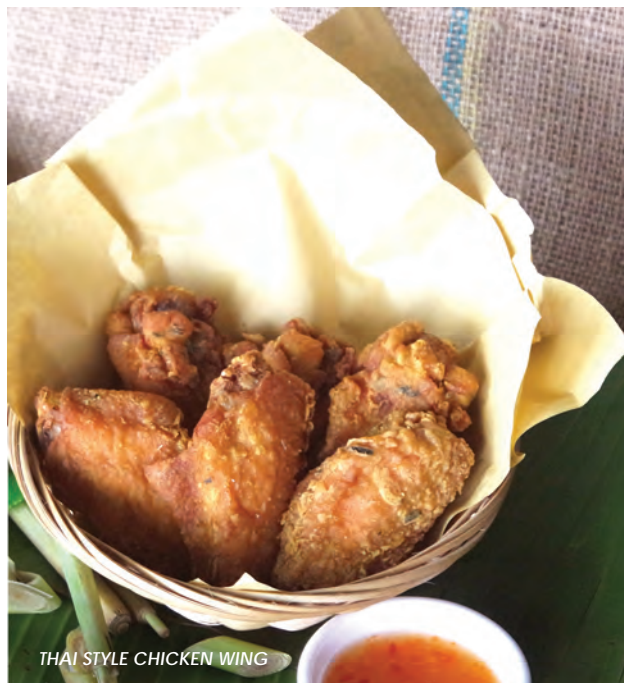
THAI STYLE CHICKEN WING