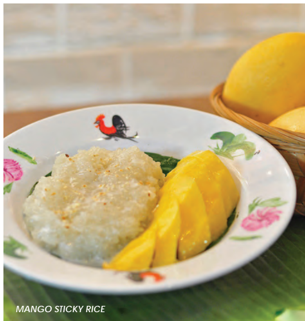
MANGO STICKY RICE