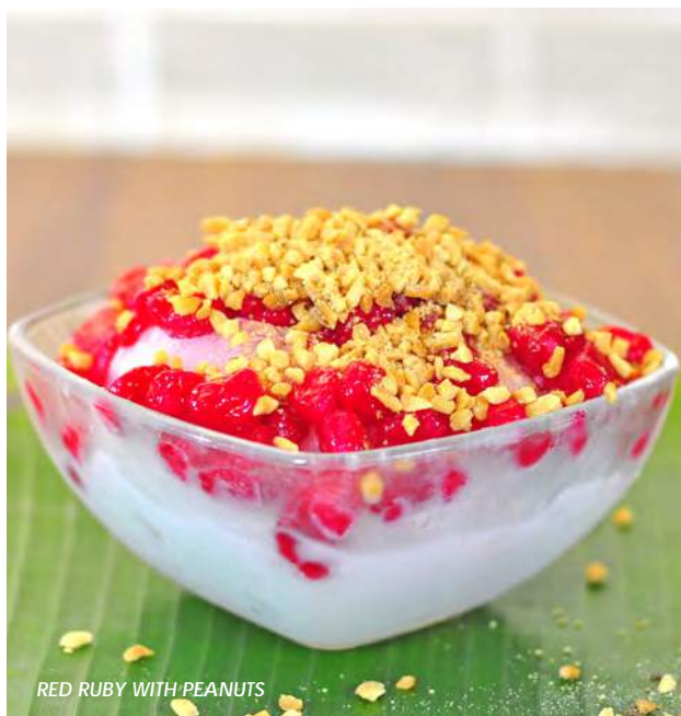
RED RUBY WITH PEANUTS

The sweet glutinous rice topped with freshly cut mango cube and coconut syrup has stolen the hearts of our diners.