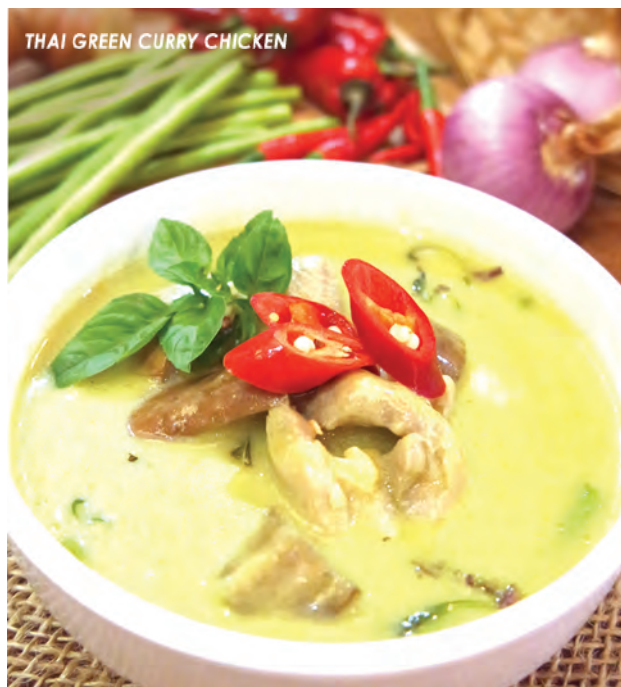
THAI GREEN CURRY CHICKEN

The Thai name 'wan' means 'sweet'. This refers to the particular color green itself and not to the taste of the curry. The Thai Green Curry is based on coconut milk and fresh green chillies giving it a creamy green also called "sweet green" in Thai.