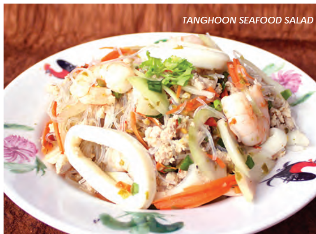
TANGHOON SEAFOOD SALAD