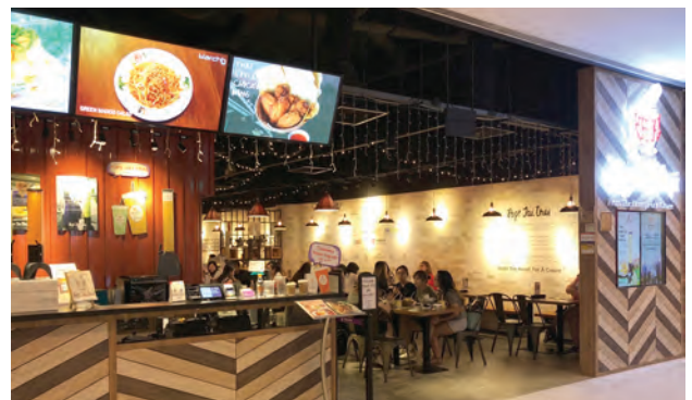
2016-2021: Pope Jai Thai at *SCAPE