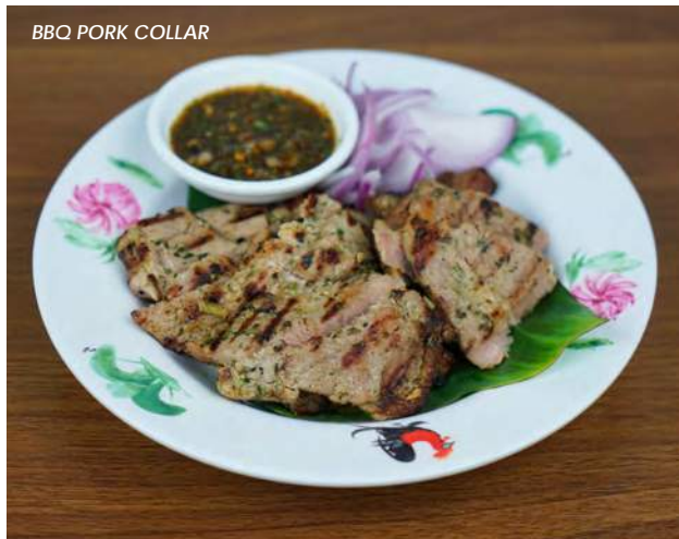
BBQ PORK COLLAR